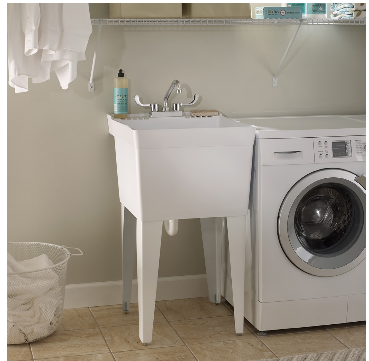
A1000 Deck Faucet sold separately